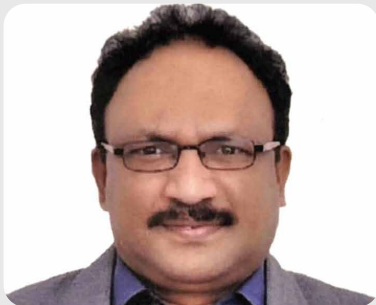
Shri. Sheik Lateef, K.A.S Registrar, Bangalore University

Bangalore University has a long-standing reputation for academic excellence, with an accreditation and endorsement of the National Assessment and Accreditation Council (NAAC), coupled with the highest grade of A++ and a Cumulative Grade Point Average (CGPA) of 3.75 out of 4 and poised to elevate the standards of distance education.